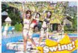
SUPER MONKEY FLOAT