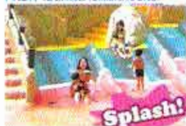
FRUIT ISLAND (Children's area)

Come feel the adventurous atmosphere as you splash about at the many Water Activities available.