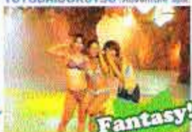
YŪYŪDAIDŌKUTSU Adventure Spa!